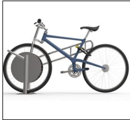
Image1: Original 'Lock Lah' Design

'Lock Lah' was the winning design from the Bicycle Bay Design Competition, co-organised by the National Crime Prevention Council (NCPC) and the Singapore Police Force (SPF) in 2013. The original design had since been further improved to incorporate additional security features.