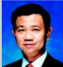
PATRON-IN-CHIEF Mr Wong Kan Seng Minister for Home Affairs